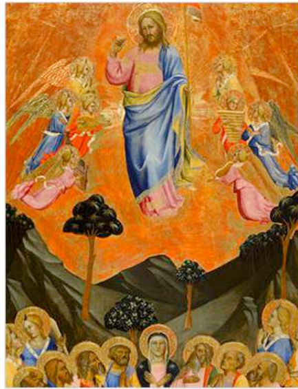
Chapel of the Crucifix, San Miniato al Monte, Florence, Italy. Restoration completed in 2018 with support from Friends of Florence. Detail of Ascension painting on poplar wood by Agnolo Gaddi (1390)

The restoration of the poplar panels—covered in linen and a thin preparatory layer—included careful analysis of modifications to the frames, gilding, paint and pigments, glue and gesso, and wooden supports. Using infrared reflectography, the artist's drawings are still visible under layers of color. Gaddi's gilding is remarkable both for its fine quality and the variety of techniques. He used water gilding for the gold grounds and the elegant "sgraffito" decorations and sizing for the many decorations along the edges of garments and for details like an angel's harp strings.